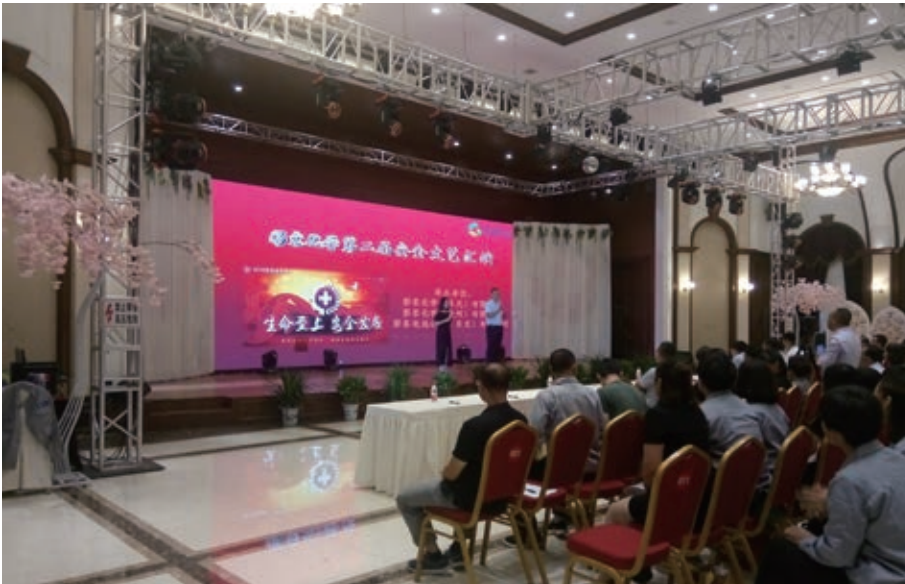
Safety literary show organized in Dongguang premise 在東光廠房舉辦的安全文藝匯演

The Group also encourages employees to participate in safety promotion activities on site or in district in addition to undergoing relevant training, so that employees can learn and communicate in a more vivid way while enhancing the Group's overall safe production awareness and promoting a safe production community. Internally, the Group has organized a number of activities, including safety literary shows, safety knowledge competitions and emergency rescue competitions. These activities allow employees to enhance safety awareness, and strengthen employees' cooperation and interaction. Externally, the Group actively participated in the Safe Production Month Program, Hekou District 2018 during the Reporting Period. According to the theme of "Prioritize your life, Safe Development", the Group held a number of safety-promoting activities and brought the concept of safe production to the community.