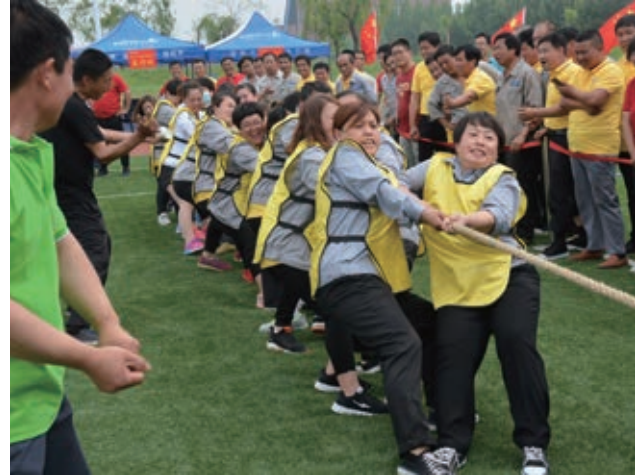
Employees participated the 13th Annual Sport day 員工參與第十三屆運動會

Attributing to the participation of the employees and the cooperation between different departments, the Group has created a corporate culture that focuses on the wellness of our employees and treats the factory as their home through various activities.