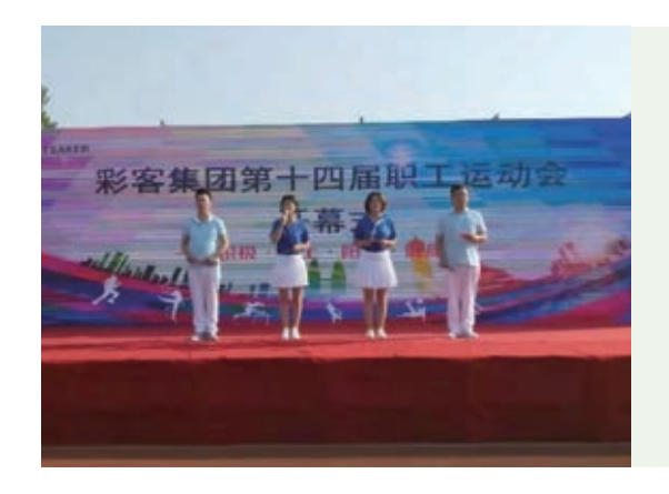
Photo 12 14<sup>th</sup> Employees Sports Game hosted by the Group