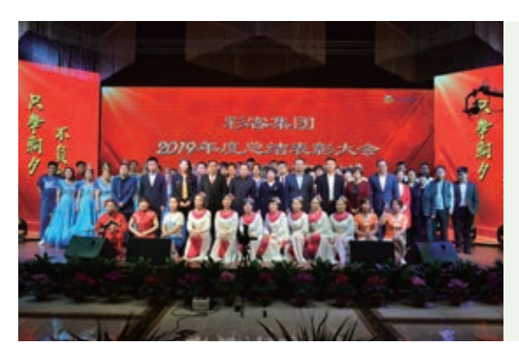
Photo 13 Annual Summary and Commendation Conference held by the Group