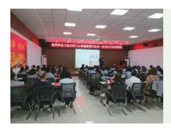
Photo 10 Mental health counseling for employees held in Cangzhou premise

除一年一度的安全文藝匯演及職工運動會外,本集團亦竭力舉辦各式各樣的員工團建活動,包括「中國夢、勞動美」職工誦讀會、歌詠比賽、演講比賽、經典戲曲演唱會、讀書及電影分享會等,旨在協助員工發展個人興趣,為其工作和生活增添色彩,共度愉快時光。